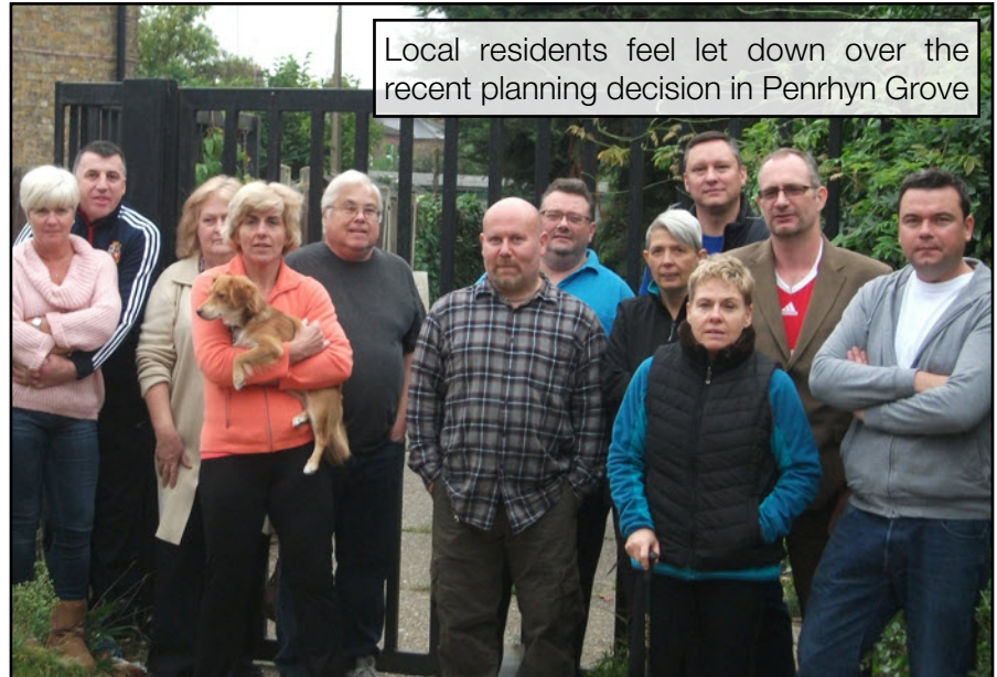
Local residents feel let down over the recent planning decision in Penrhyn Grove