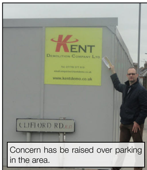
Concern has be raised over parking in the area.